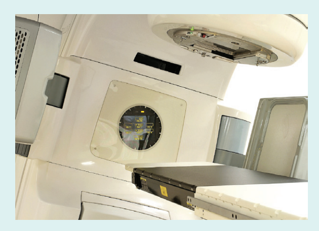
A linear accelerator is used to give radiation treatment.