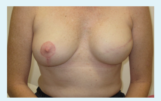
Figure 2: This woman had a left mastectomy and reconstruction using a tissue expander and a breast implant. She also had a breast lift on the right side to balance the breast size and shape. She has not undergone nipple reconstruction.

Sometimes tissue expansion is combined with some form of mesh to help create a more natural looking result.